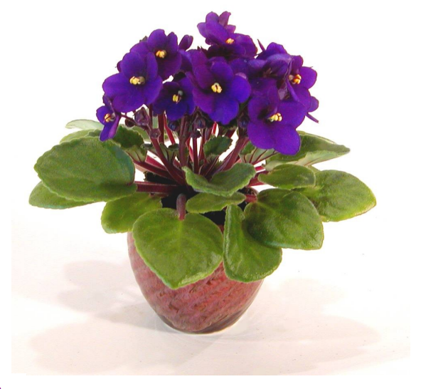
2" ITEM # 42269